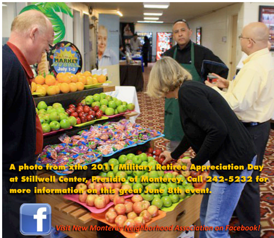
A photo from the 2011 Military Retiree Appreciation Day at Stillwell Center, Presidio of Monterey. Call 242-5232 for more information on this great June 8th event.